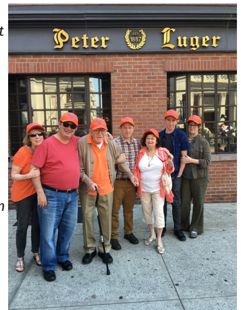
The Solomon Family celebrating Cookie's 92nd Birthday