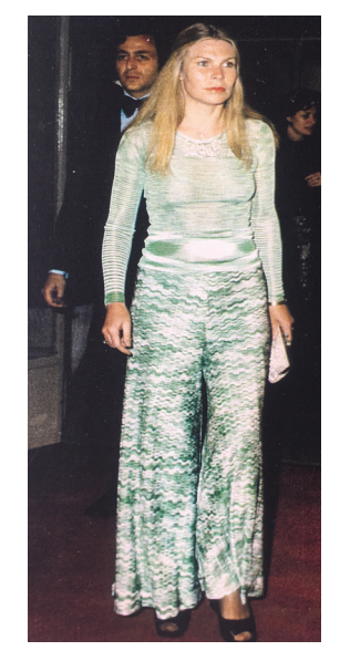
At the Cannes Film Festival in 1972.

After realizing that there were few theaters interested in showing independent films, Joseph founded the Angelika Film Distributor, and later the Angelika Film Center in 1989. The theater was very successful, especially because in the '90s independent films were very much in vogue. Angelika herself had a keen eye for film and loved picking films for the Angelika Film Center. The theater showed Pulp Fiction and Quentin Tarantino thanked the Angelika by name in his Oscar speech.